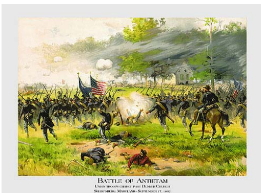
BATTLE OF ANTIETAM UNION REGIMENT, 150th ILLINOIS INFANTRY SEPTEMBER 17, 1862

Manassas in August. Lee marched his army of Northern Virginia into Maryland, hoping to find much needed men for his army and find supplies. General McClellan stocked, first to Frederick. Where that savage Lee's special order No. 191, came into his grasp. Since General Robert E. Lee is such an idiot, he thought he could beat the North after he split his army in half of the troops and sent them to help General "Stonewall" Jackson to capture Harper's Ferry.